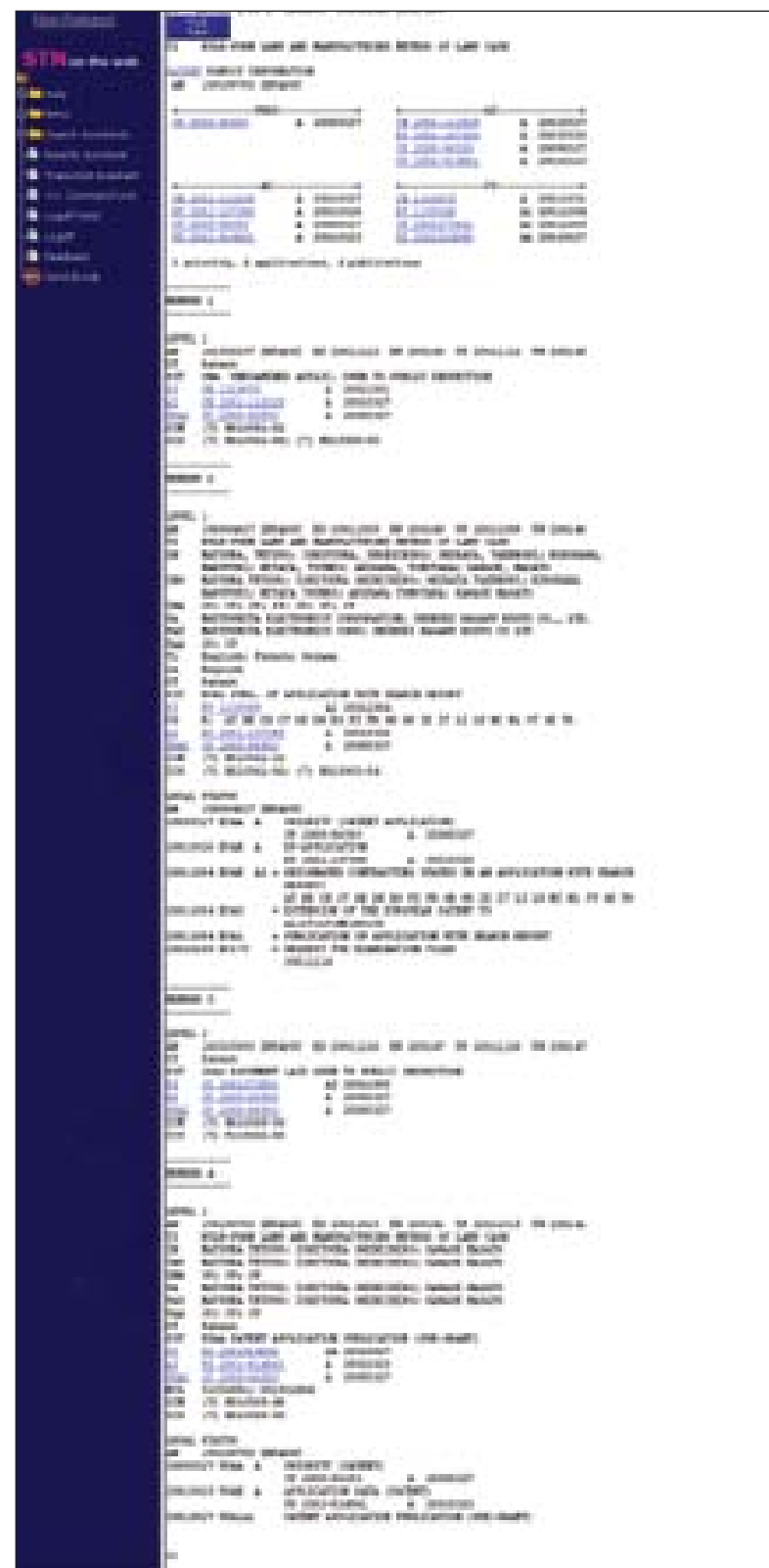
An INPADOC record via STN on the Web

STN International offers many databases which perfectly complement Derwent WPI, such as the international patent family and legal status database INPADOC.